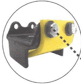
Pictured: EWP Hanger Poly Warepad installed over OEM Wear Pad

EWP Warepad is installed over the Peterbilt hanger steel pad