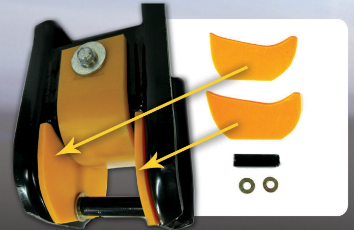
Pictured: Reyco Transpro 88 Fabricated Rear Hanger installed with Side Plates & EWP Warepad along with sample of kit which includes Side Plates and fasteners.